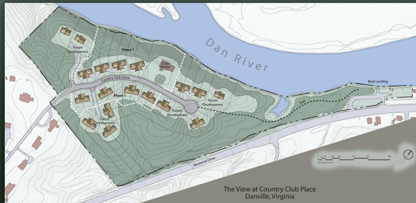
The View at Country Club Place Danville, Virginia